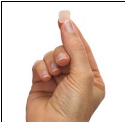
Figure B. Correct Administration of ONSOLIS